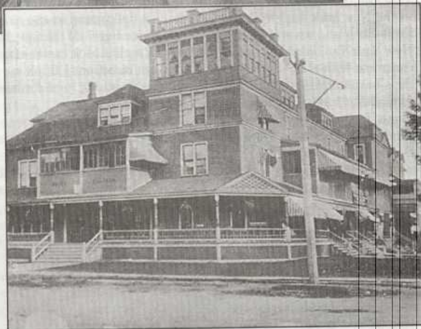
[UPPER] The famous Celoron Gold Band, their name coming from the gold plating on their horns. Organized in 1896, the members were mostly local musicians. As the drum facing notes, they were also known as the Gage Gold Band. [ABOVE ] The dining room of the Hotel De Celoron . [RIGHT] The Hotel De Celoron.