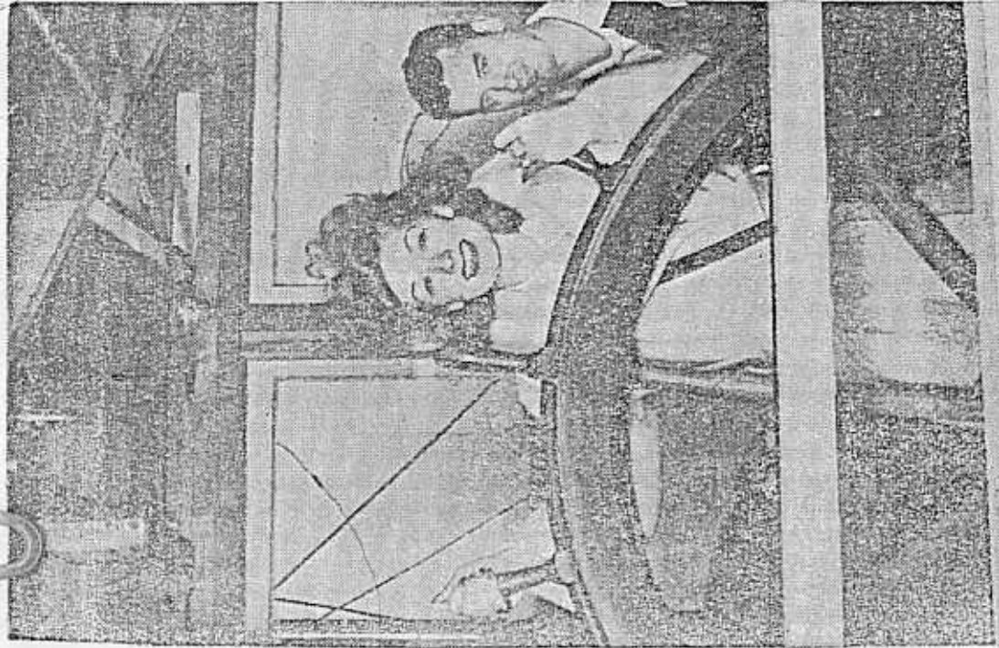
LUCY AS A STEAMBOAT "SKIPPER" —Lucille Ball, Jamestown's contribution to film and television stardom, is shown at the wheel of the SS. City of Jamestown during her 1946 visit here. She took part in the annual backstage boatride of the Little Theater on that occasion.