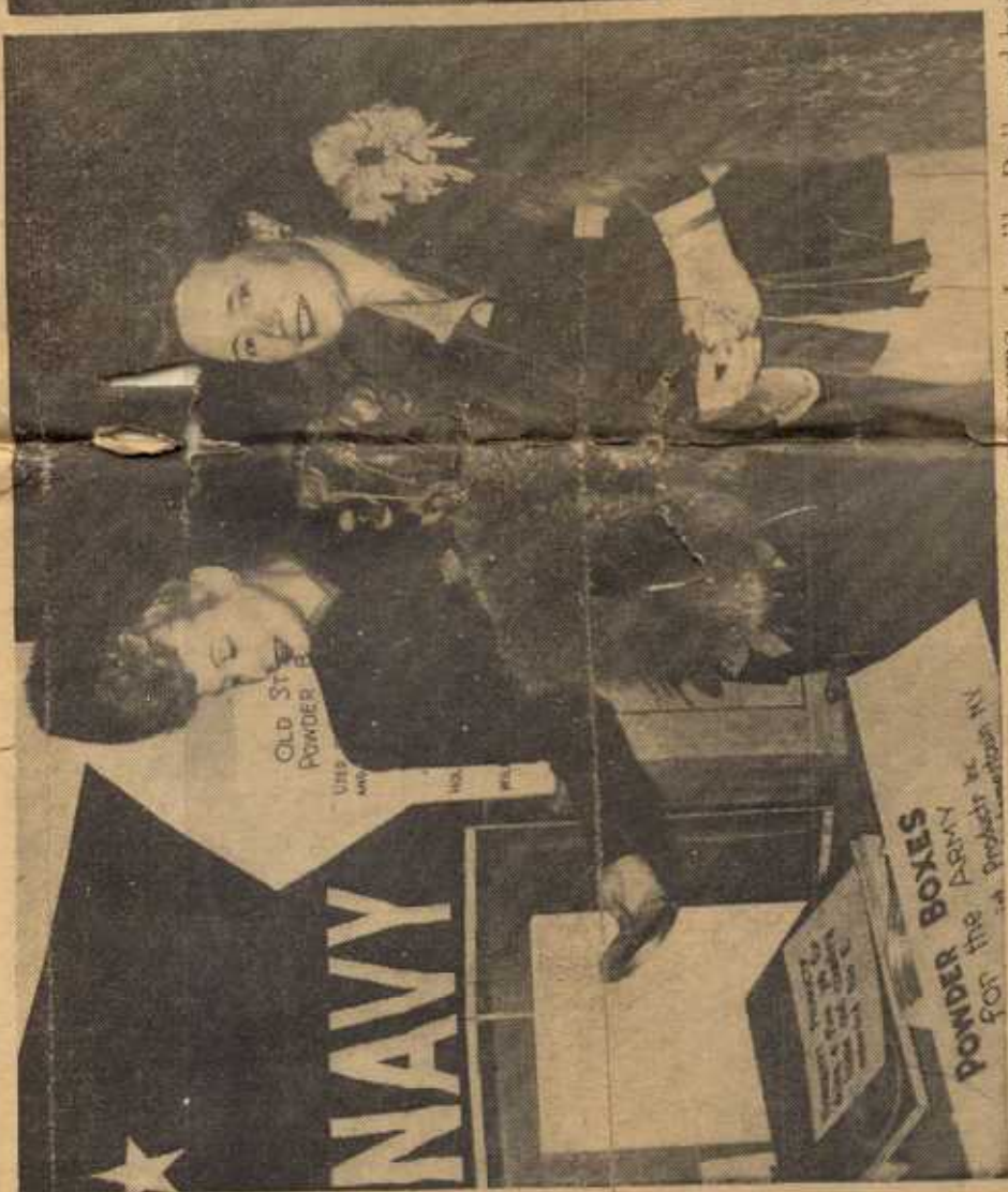
MOVIE STAR VIEWS HOME TOWN PRODUCTS —Lucille Ball, red-haired star of the movies is shown at the left inspecting parts of a powder box built by the Norquist Products, Inc., on display in the exhibit at the Hotel Jamestown. At the right, the movie star views a door made by the Hope's Windows.