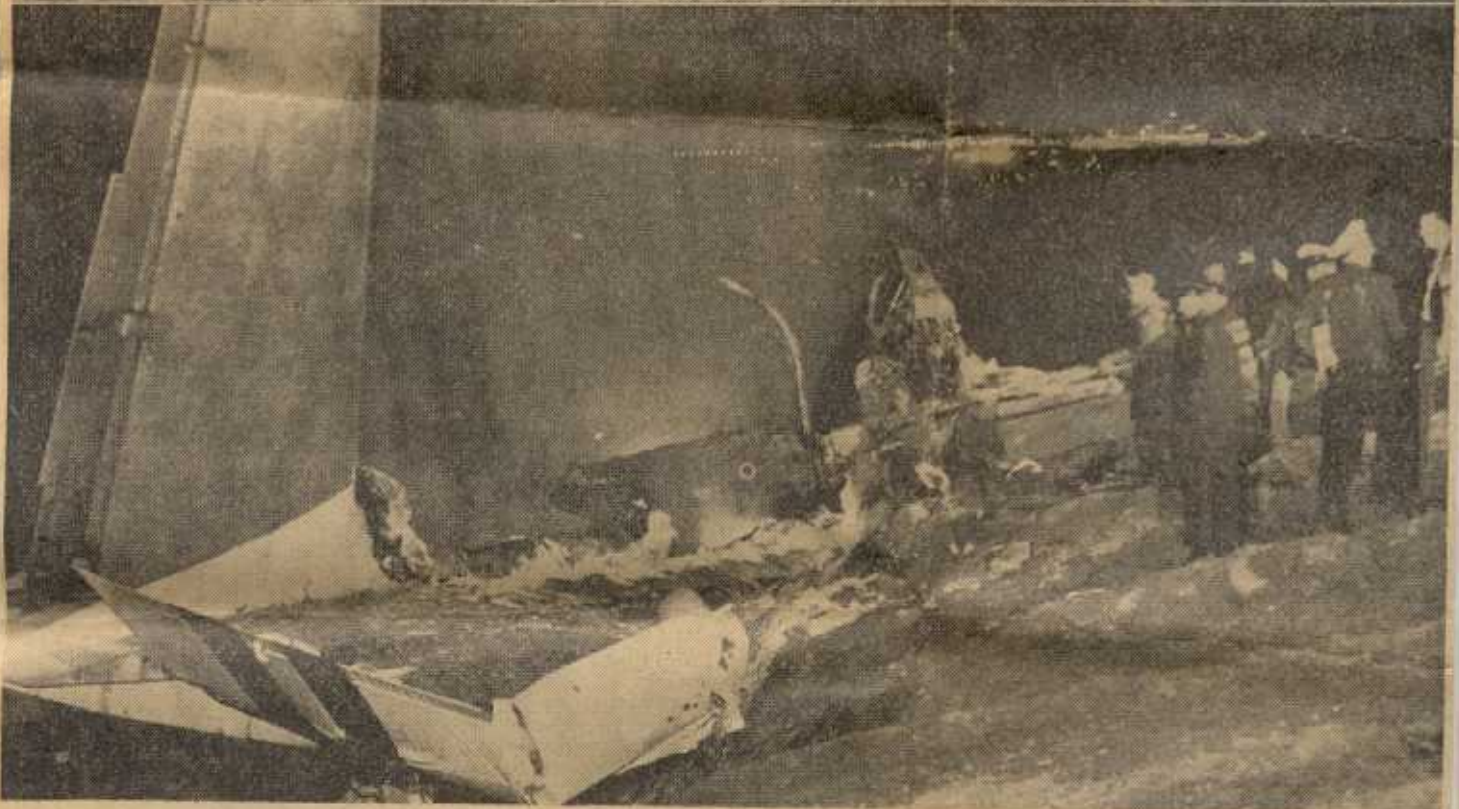
FATAL CRASH SCENE —Police and airport personnel in top picture inspect wreckage of a twin-engine TWA airliner which crashed at Pittsburgh last night, killing 22 of the 36 persons aboard. Lower scene is another view of the wreckage with airport building lights in the background. The plane crashed seconds after taking off on a flight to Newark, N.J.