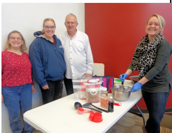
Eat Smart New York Nutrition Program