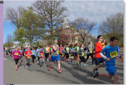
Run for Literacy