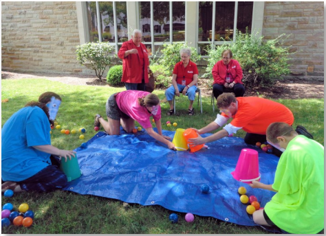
Life-Sized Games (Hungry, Hungry Hippos)

Our Summer Reading Partners included: JPS Summer Literacy Camp YWCA YMCA Boys and Girls Club Jamestown Parks Department St Luke's St Bonaventure Girl Scout World Travelers Foster grandparents NYS LEAH A Children's Place Food Bank of WNY Jock Shop