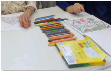
Adult Coloring Club