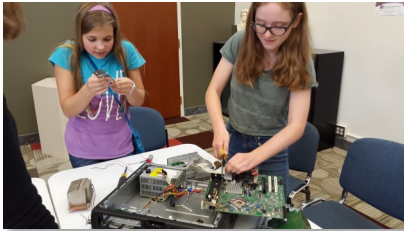
STEM for Teens