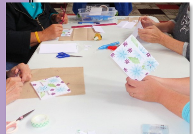
Happy Stampers Club