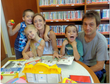
Reading Together & Family Literacy

The Foster Grandparent Program donated 719.25 hours to our Summer Reading Program